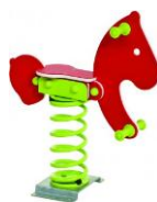
Zabawka na sprężynie